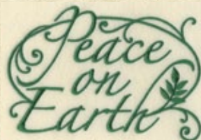
hdcc-21 6.7" W - 4.7" H