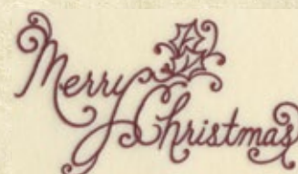
hdcc-16 6.7" W - 3.9" H