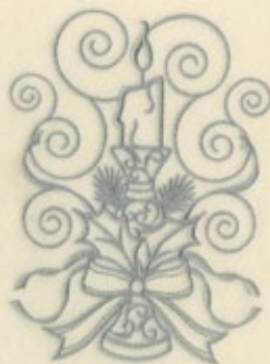
hdcc-6 5.7" W - 7.8" H