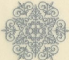
hdcc-4 5.7" W - 5.0" H