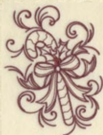
hdcc-9 4.7" W - 6.3" H