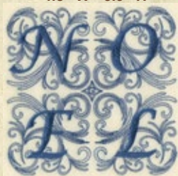
hdcc-8 5.7" W - 5.7" H