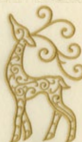
hdcc-14 3.9" W - 6.7" H