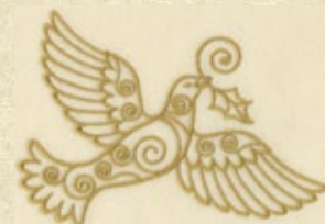
hdcc-17 6.8" W - 4.8" H