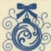
hdcc-5 3.7" W - 3.8" H