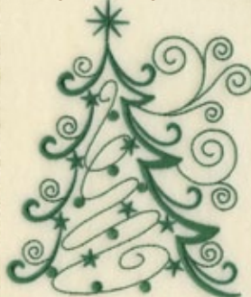
hdcc-7 4.8" W - 5.9" H