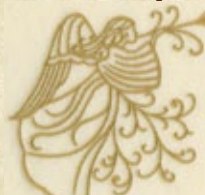
hdcc-10 4.7" W - 4.8" H