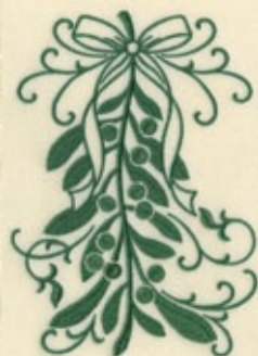
hdcc-3 5.7" W - 5.7" H