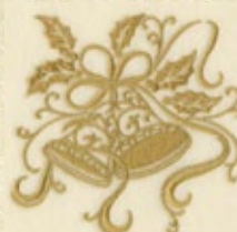
hdcc-11 4.8" W - 4.8" H