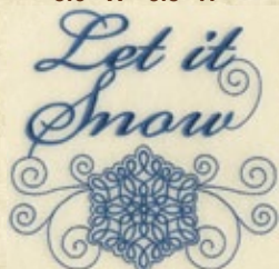
hdcc-2 5.4" W - 7.8" H