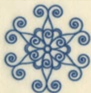
hdcc-1 3.6" W - 3.8" H

21 designs all for the 4x4, 5x7 and 6x10 hoops. Sizes listed below.