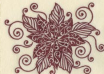
hdcc-15 7.9" W - 5.7" H