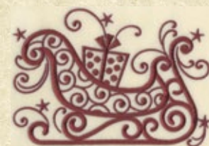
hdcc-18 6.7" W - 4.8" H