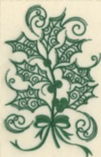
hdcc-20 5.7" W - 9.2" H