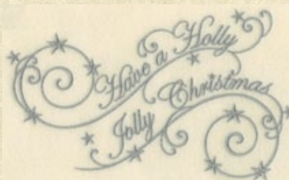
hdcc-13 9.7" W - 5.8" H