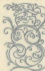
hdcc-19 4.3" W - 6.7" H

visit our website at www.anita-goodesign.com