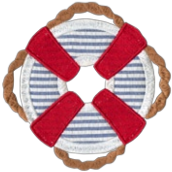
abah10 4.7" h - 4.8" w