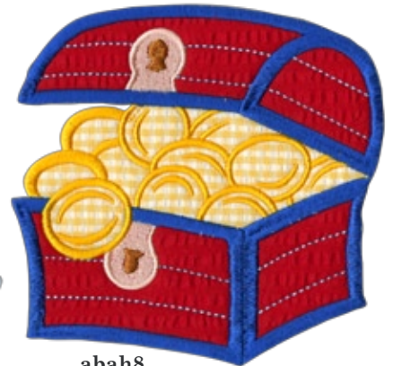
abah8 4.9" h - 4.8" w