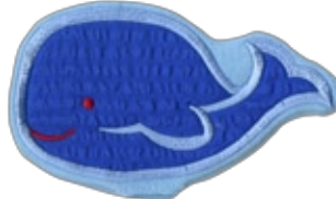
abahS3 6.5" h - 4.0" w