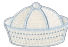
abah12 2.7" h - 1.8" w