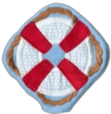
abahS1 4.0" h - 4.8" w