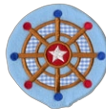
abahS4 4.7" h - 4.8" w