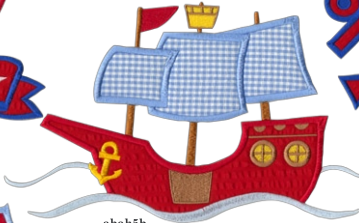
abah5b 10.8" h - 6.8" w