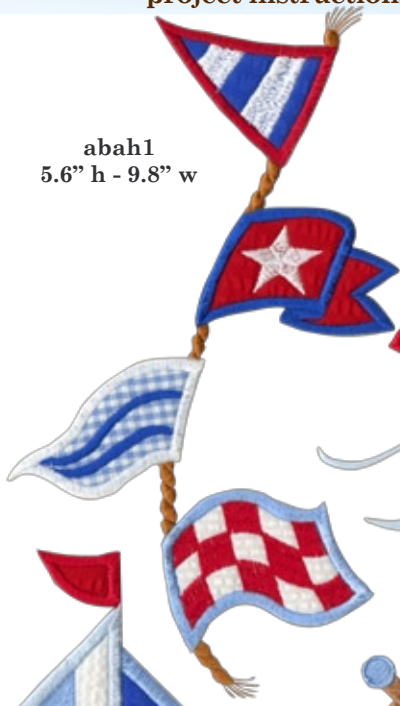
abah1 5.6" h - 9.8" w

28 Designs total- All baby collectons include applique designs, stuffed animal designs and project instructions for: Quilts, Diaper Bags, Bumper Pads, Wall Hangings and Mobiles.