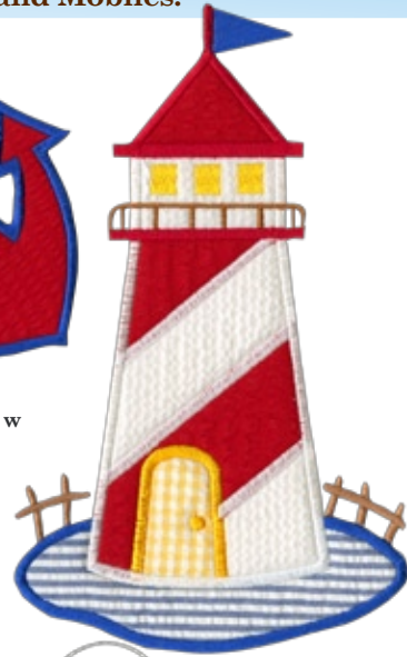
abah2 4.1" h - 6.8" w