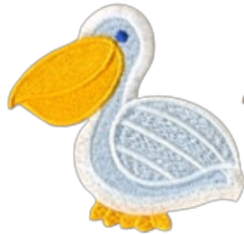
abah13 3.2" h - 3.2" w