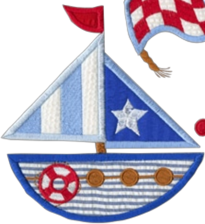
abah4b 5.7" h - 6.5" w