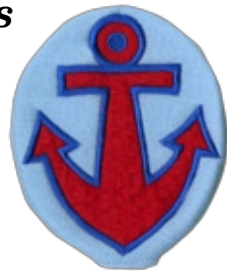
abahS2 4.8" h - 5.7" w