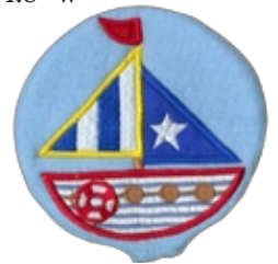
abahS5 4.7" h - 4.8" w

visit our website at www.anita-goodesign.com