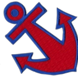
abah7b 5.8" h - 5.8" w