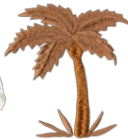
abah11 3.2" h - 3.4" w