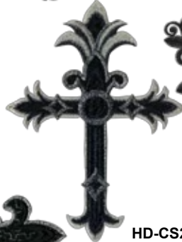
HD-CS23 4.8" W - 6.6"H