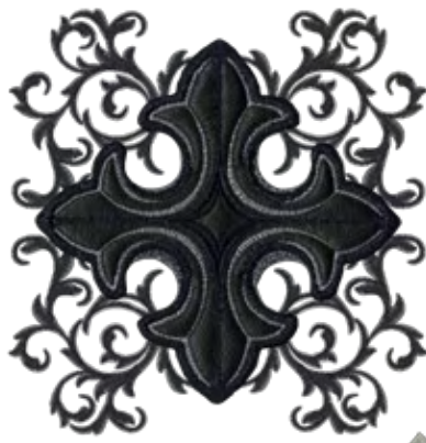
HD-CS5 6.8" W - 6.8"H