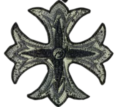
HD-CS15 6.8" W - 6.8"H