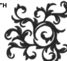
HD-CS18 3.8" W - 3.8"H