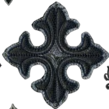
HD-CS8 6.8" W - 6.8"H