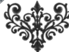
HD-CS16 3.8" W - 3.0"H