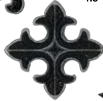
HD-CS7 3.5" W - 3.5"H