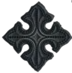
HD-CS9 3.6" W - 3.6"H