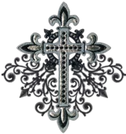
HD-CS10 6.8" W - 7.4"H

47 designs all for the 4x4 and 5x7 hoop Each deluxe design comes in three formats: small, medium and large sizes Note: Not all designs shown here