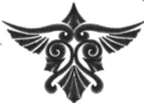
HD-CS17 3.8" W - 2.8"H