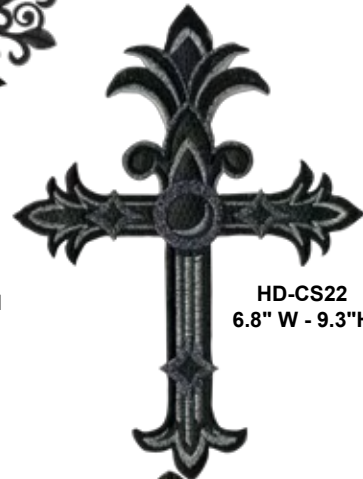
HD-CS22 6.8" W - 9.3"H