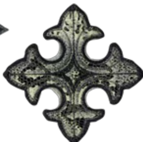
HD-CS6 6.6" W - 6.8"H