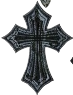
HD-CS2 4.8" W - 6.3"H