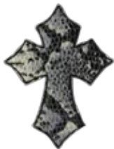
HD-CS4 2.7" W - 3.5"H