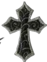
HD-CS19 2.8" W - 3.8"H