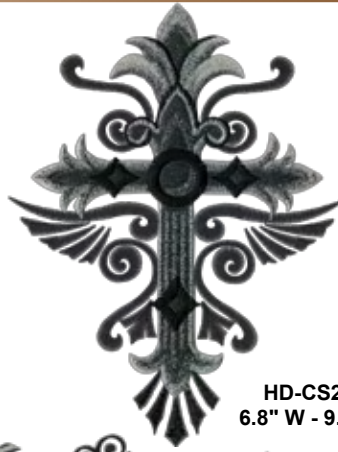
HD-CS21 6.8" W - 9.0"H