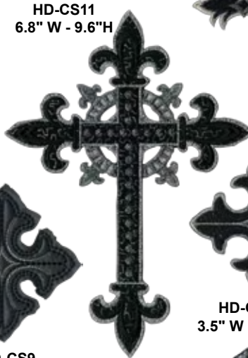
HD-CS11 6.8" W - 9.6"H