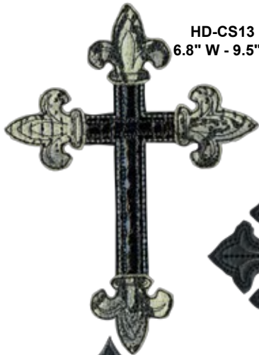
HD-CS13 6.8" W - 9.5"H