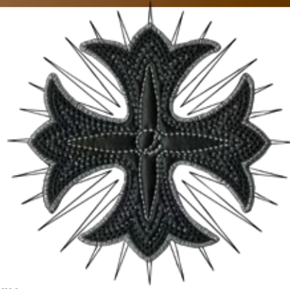
HD-CS14 6.8" W - 6.8"H