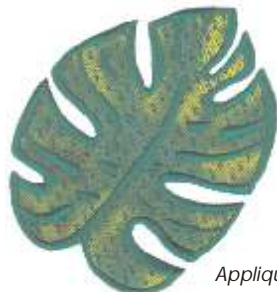
Applique HDHI10 - H 5.1"X W 4.7"