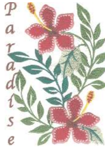
HDHI1 - H 6.8"X W 4.9"