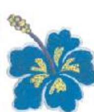
HDHI7 H 3.0"X W 2.7"