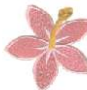
HDHI14 H 2.9"X W 2.9"