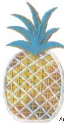
Applique HDHI16 - H 6.0"X W 3.2"