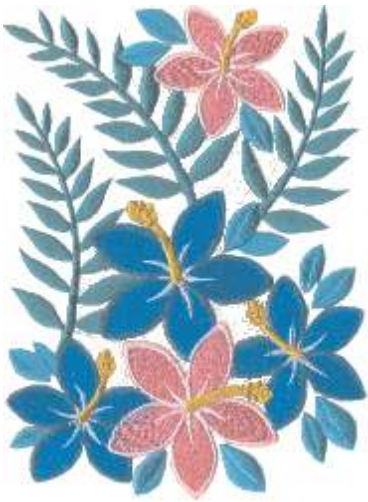
HDHI11 - H 6.6"X W 4.8"

19 designs all for the 4x4 and 5x7 hoop - Tutorial PDF File included on CD-Rom This collection includes applique and light fill designs.