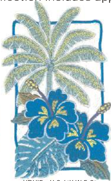
HDHI5 - H 9.6"X W 5.9" HDHI5B - H 6.9"X W 4.3"