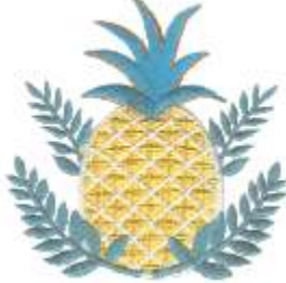
HDHI15 - H 3.8"X W 3.8"