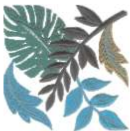
HDHI18 - H 3.8"X W 3.8"