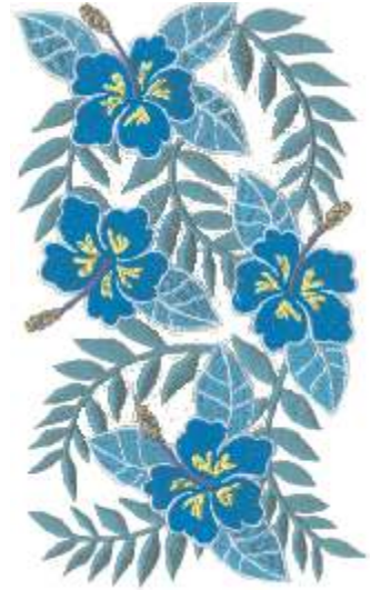
HDHI17 - H 6.8"X W 3.9"