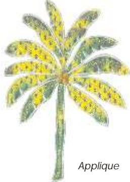
Applique HDHI13 - H 6.8"X W 4.7"