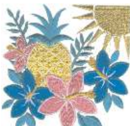
HDHI9 - H 3.7"X W 3.7"