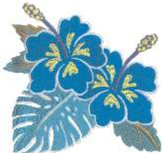
HDHI6 - H 4.9"X W 4.9"