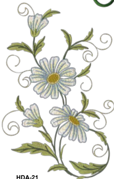
HDA-21 4.2" W - 6.7"H