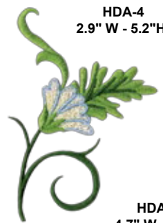
HDA-4 2.9" W - 5.2"H