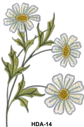
HDA-14 4.57" W - 6.7"H