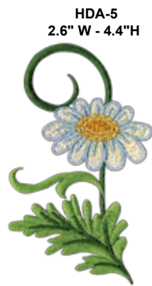
HDA-5 2.6" W - 4.4"H