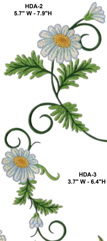
HDA-2 5.7" W - 7.9"H