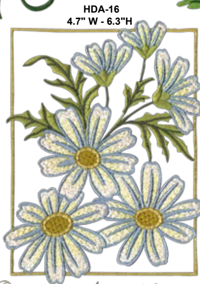
HDA-16 4.7" W - 6.3"H