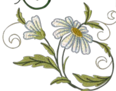
HDA-22 5.97" W - 4.74"H