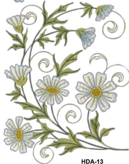
HDA-13 5.7" W - 7.6"H