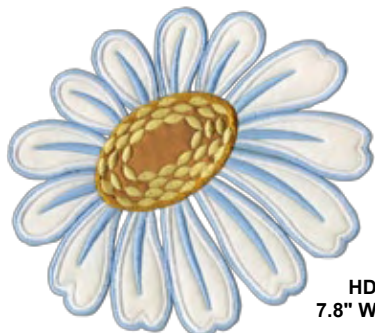
HDA-10 7.8" W - 7.1"H