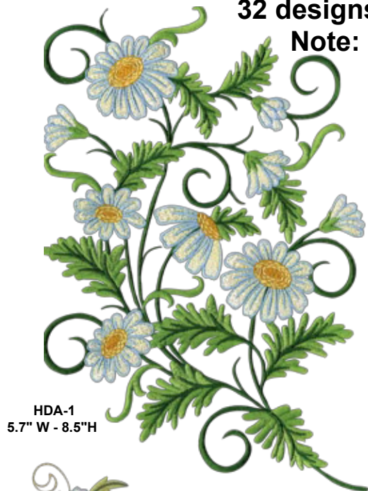
HDA-1 5.7" W - 8.5"H