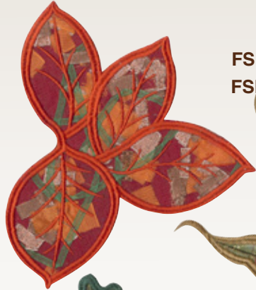
FSL15b 4.5" w x 4.8" h