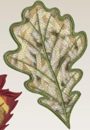
FSL11b 3.6" w x 4.8" h