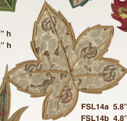
FSL14a 5.8" w x 5.6" h