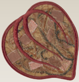
FSL16a 4.0" w x 4.2" h