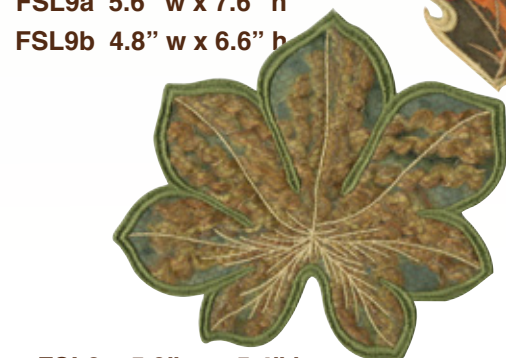
FSL9b 4.8" w x 6.6" h