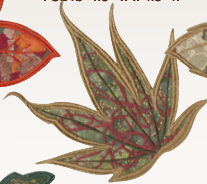
FSL4b 4.6" w x 4.8" h