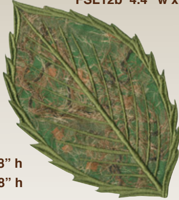
FSL12b 4.4" w x 4.7" h